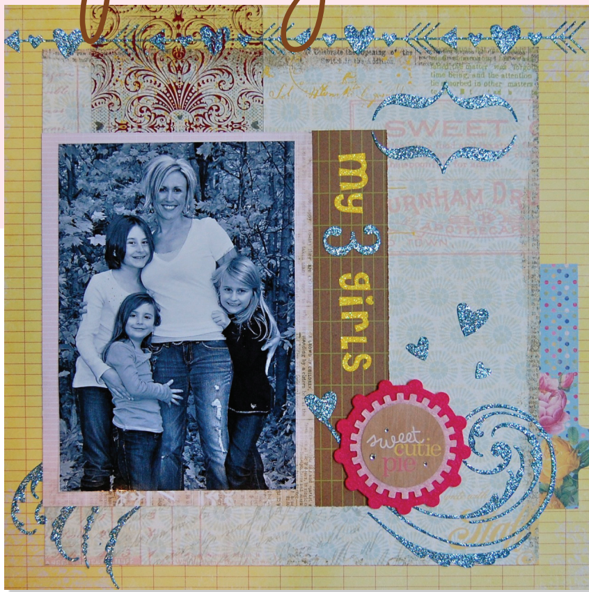
SWEETNESS 12 x 12 LAYOUT by tina albertson