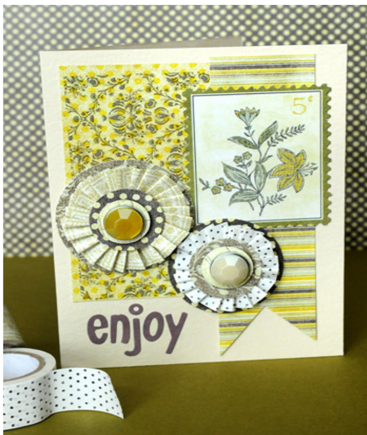
Enjoy Card by vicki boutin